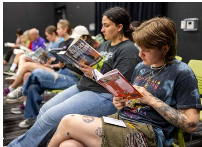
"Book Tasting" at Fretz Park Branch