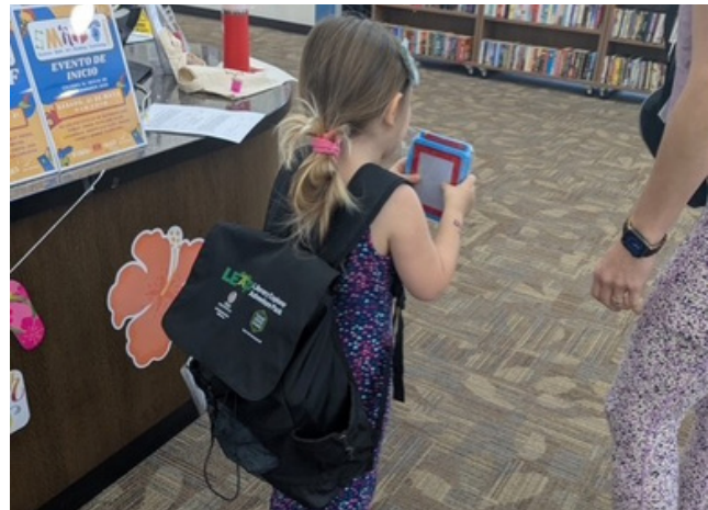
First LEAP kit check out at Renner Frankford Branch