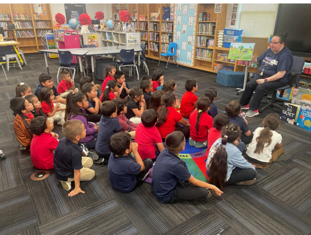
Dallas West Branch School Visit