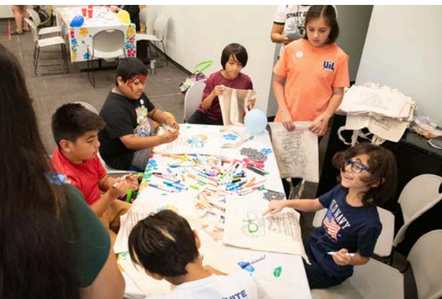
SMART Summer Kickoff at North Oak Cliff Branch