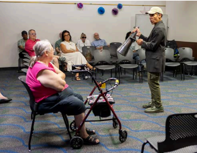
The Modern Cajon Jazz Ensemble performing at Park Forest Branch