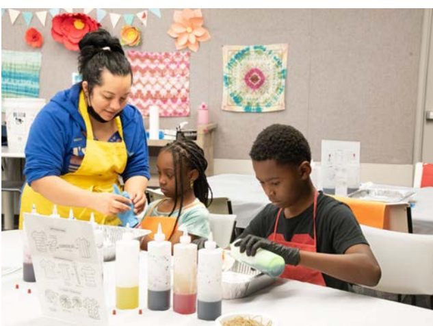
Painting bandanas at Mountain Creek Branch