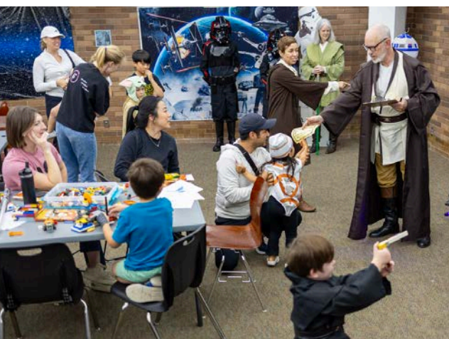
May the Fourth Party at Preston Royal Branch