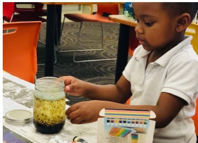
Lava lamps at Arcadia Park Branch