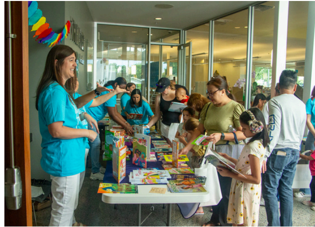
SMART Summer Kickoff at Lochwood Branch

A young student from the Art, Music & Movies drawing classes was accepted into the Booker T. Washington High School Visual Arts program. One of the pieces he did in class was part of his audition portfolio.