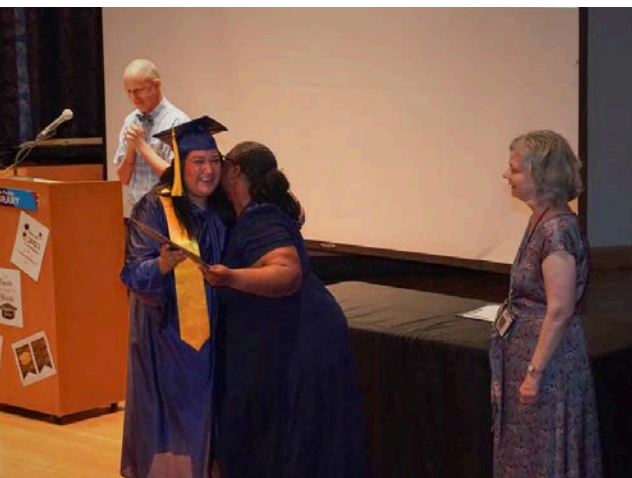
GED Graduation Ceremony at Central Library