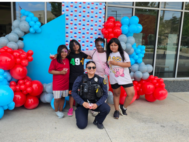
Popsicles with Police at Vickery Park Branch

Dallas Public Library brought the community together for Cinco de Mayo at 12 locations, including a performance and dance workshop from Cara Mia Theatre at Mountain Creek Branch and Ollimpaxqui Ballet Company at Prairie Creek Branch . Both were made possible through the Office of Art and Culture. DPL also participated in Cinco de Mayo events at Old City Park and the parade in Oak Cliff.