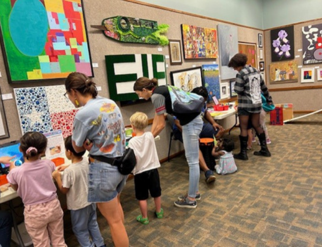
Lakewood Branch Friends' Art Show