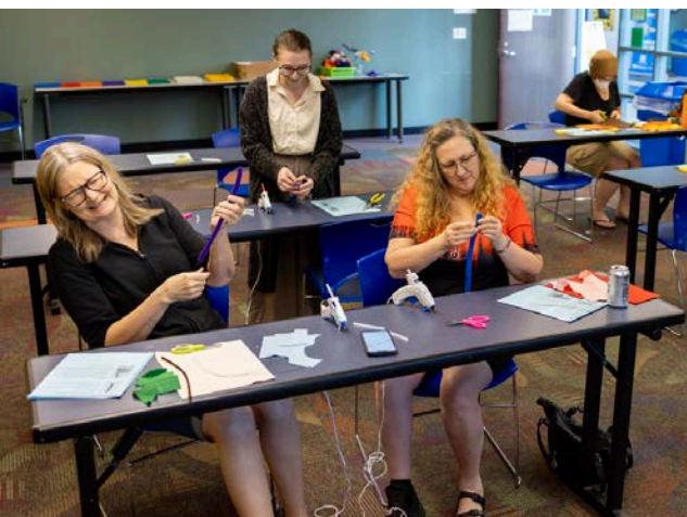
Making a felted blossoms craft at Timberglen Branch

Eliminating barriers to service is a priority. Materials, programs and services are always free, and library staff work to make information, technology and city services easily accessible.