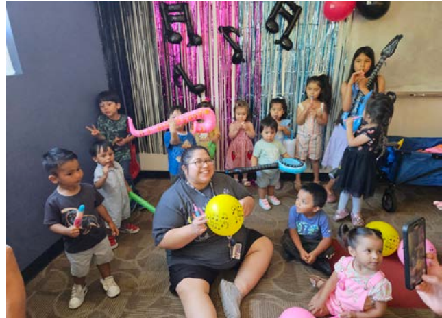
Rhythm & Play end-of-year party at Pleasant Grove Branch

The Regency Swords and Dueling program at Dallas West Branch had a big fan: "That was the coolest. I got to hold a real life sword, when will they be back?" As he left the library he continued, "Mom, touché, remember touché is what that guy said when he was hit fencing."