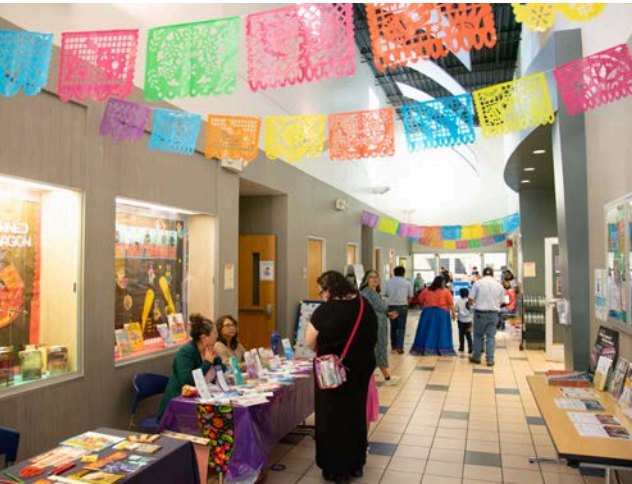
Cinco de Mayo at Arcadia Park Branch

Dallas Public Library builds community through programming and outreach that connects people to library services and to each other.