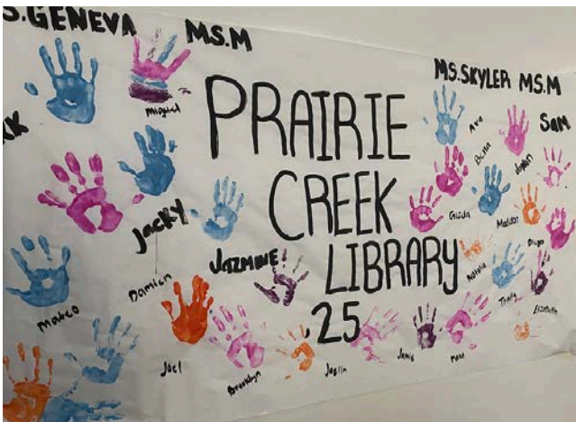
Campers' wall art at Prairie Creek Branch