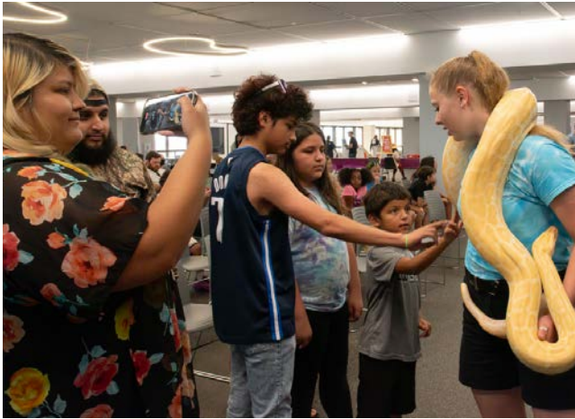
Community Nature Expo at Central Library