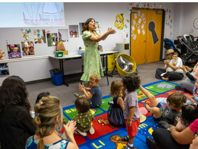
Mad Hatter Storytime at Oak Lawn Branch