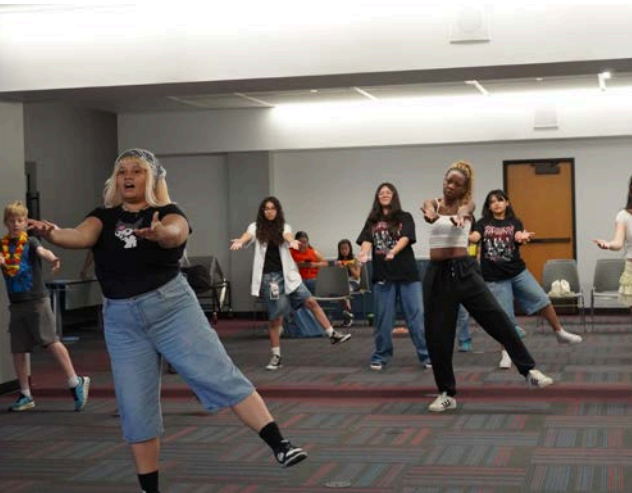
KPoppin' at Central Library