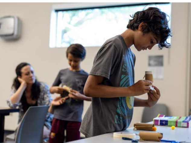
SMART Summer Fireball Launchers at Forest Green Branch

Eliminating barriers to service is a priority. Materials, programs and services are always free, and library staff work to make information, technology and city services easily accessible.