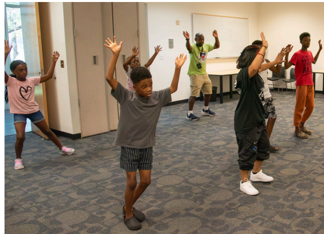
End of Summer Party at Paul Laurence Dunbar Lancaster-Kiest Branch