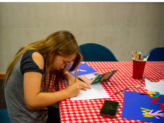
Little Artist Academy at Skillman Southwestern Branch

People came together at DPL in June to celebrate shared interests. At Oak Lawn Branch , Pride Month festivities included an event featuring LGBTQ-themed crafts, a DJ and vendors selling Pride merch or sharing information on community resources. At Central Library , K-pop fans gathered for K'Poppin, which included crafts related to their favorite groups, K-pop choreography, photocard trading and performances by local groups.