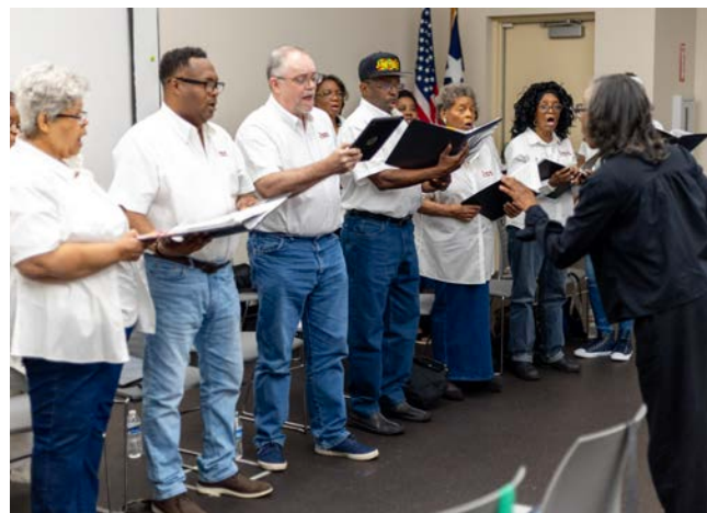
Juneteenth Celebration at Forest Green Branch