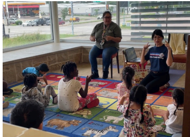
Storytime at Prairie Creek Branch