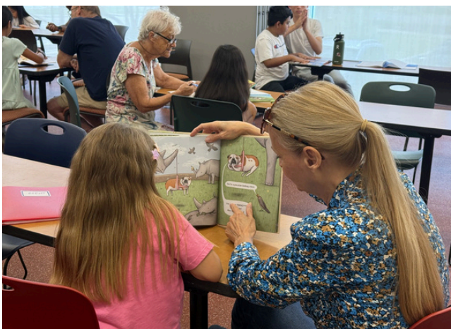
Volunteers helping kids with their reading skills at Lochwood Branch