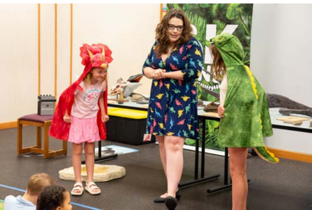
SMART Summer Kickoff at North Oak Cliff Branch