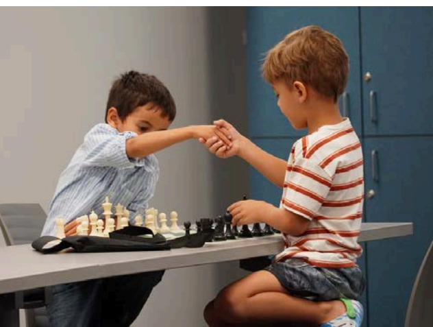
Chess players during Strategy Saturday at Central Library