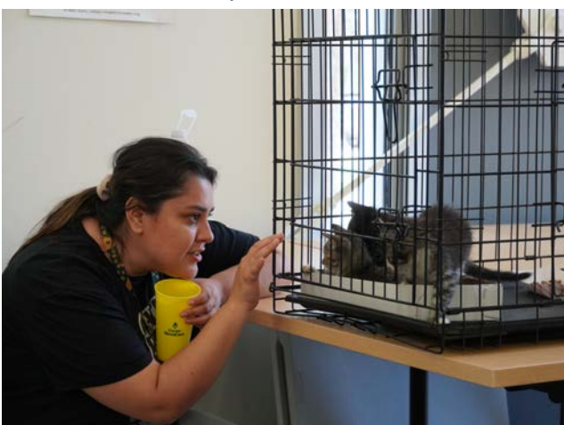
Cat Adoptions at White Rock Hills Branch