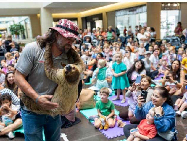
Slippery and Slow at Bookmarks at NorthPark Center