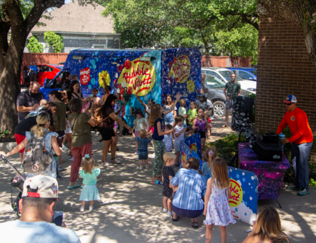
Bubble Party at Lakewood Branch