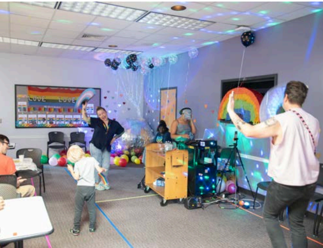
Pride Inside the Library at Oak Lawn Branch

Dallas Public Library builds community through programming and outreach that connects people to library services and to each other.