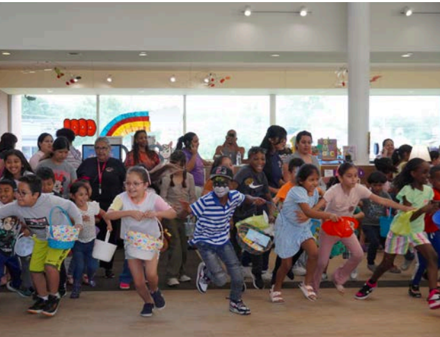
Spring Eggstravaganza at Prairie Creek Branch

Dallas Public Library builds community through programming and outreach that connects people to library services and to each other.