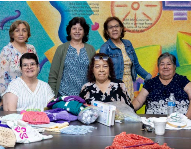
Members of the Knitting Club at Grauwylar Park Branch