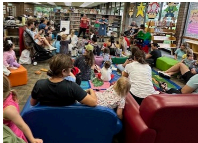
Storytime at Lakewood Branch