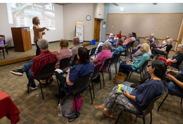
Lakewood Library Friends Present: An Evening with Bonton Farms at Lakewood Branch