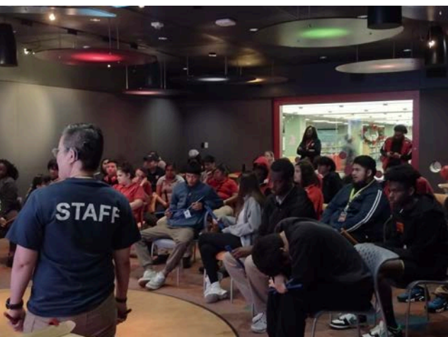
Woodrow Wilson HS students at Central Library 2 nd Floor

Eliminating barriers to service is a priority. Materials, programs and services are always free, and library staff work to make information, technology and city services easily accessible.