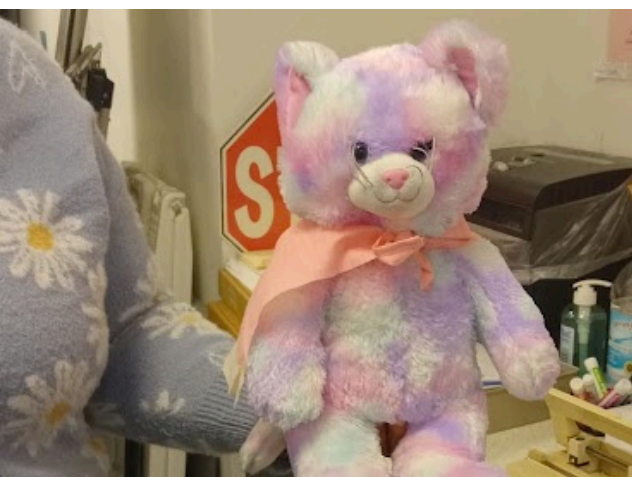
Staff at Highland Hills Branch washed and dressed a found bear before reuniting it with its owner