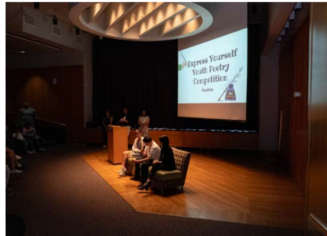
The Express Yourself Youth Poetry Competition Awards at Central Library