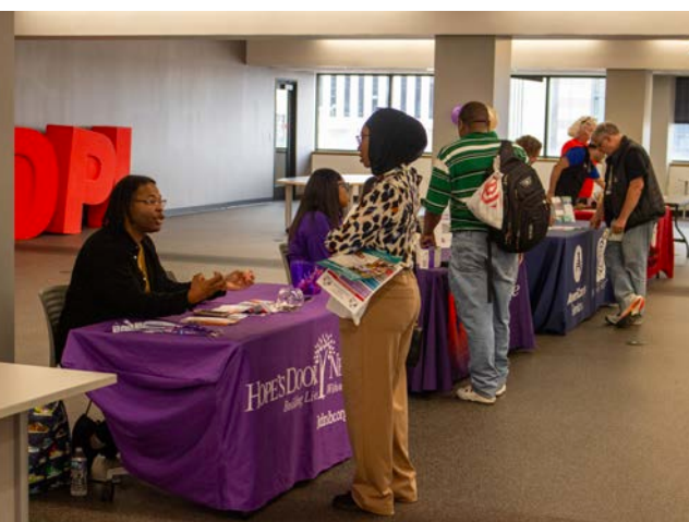
Volunteer Fair at Central Library

Dallas Public Library leaped into spring in April, with several festivals, egg hunts and bunny-themed events at North Oak Cliff, Vickery Park, Lancaster-Kiest, Pleasant Grove, Prairie Creek, Skyline, Forest Green, Lochwood and Mountain Creek Branches.