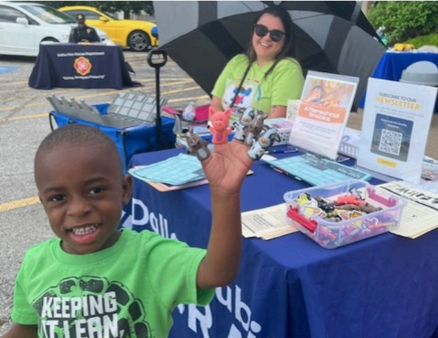
White Rock Hills Branch at the HeadStart of Greater Dallas Community Resource Fair