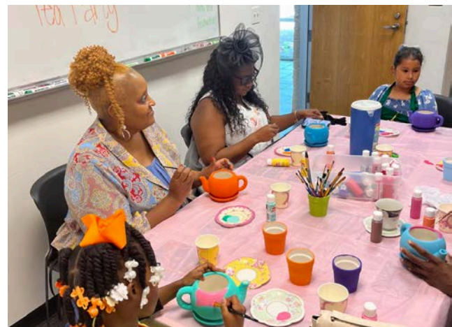
Learning about tea and painting tea pots at the Lancaster-Kiest Branch Community Tea Party