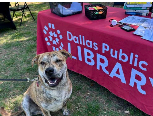
A happy library customer in the Town of Addison