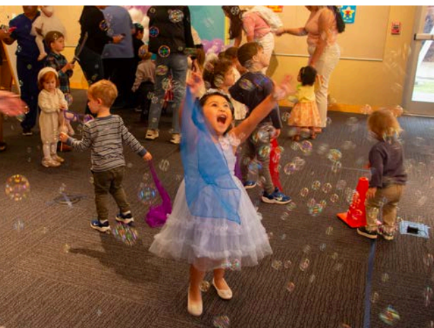
Preschool Prom at Audelia Road Branch