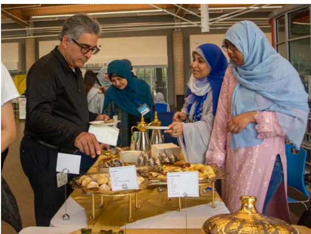
The annual Eid celebration at Vickery Park Branch