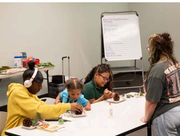
Eggs and Bunnies in Art presented by the Nasher Sculpture Center at North Oak Cliff Branch