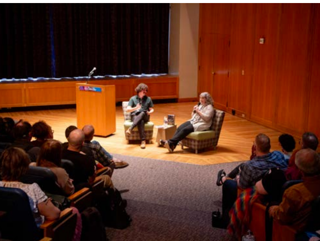
Author Martha Wells at Central Library